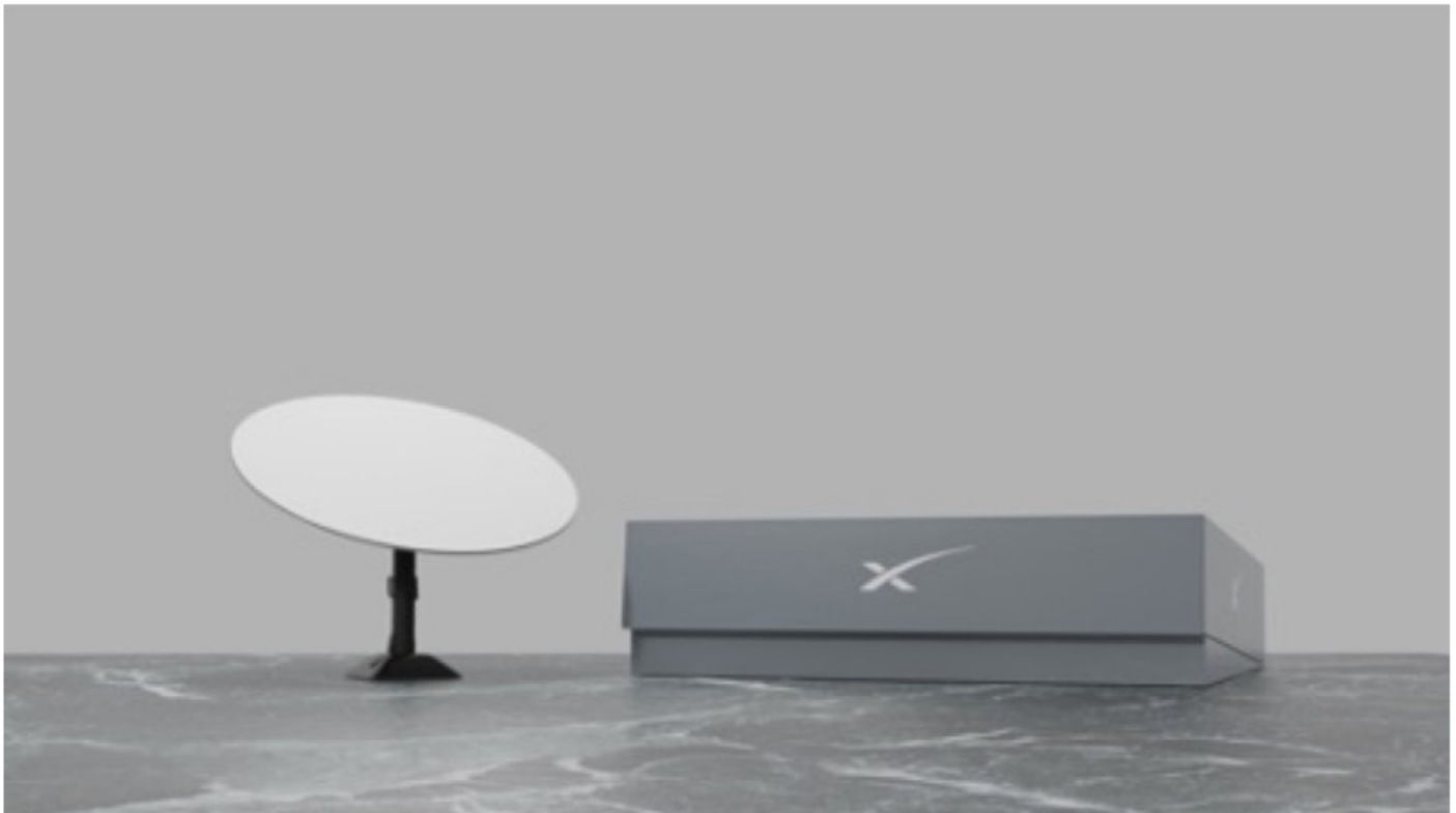
Starlink User Terminal.

Additionally, NGSO constellations allow for smaller aperture antennas to connect with the satellites, meaning tactical users no longer need to lug around trailer-mounted SATCOM equipment and deploy very obvious parabolic reflectors. And consider that these very small – in some cases 30 cm. in diameter – user terminals will generate hundreds of megabits per second of throughput as compared to the 5-10MBPS military links using 2.4M antennas get today.