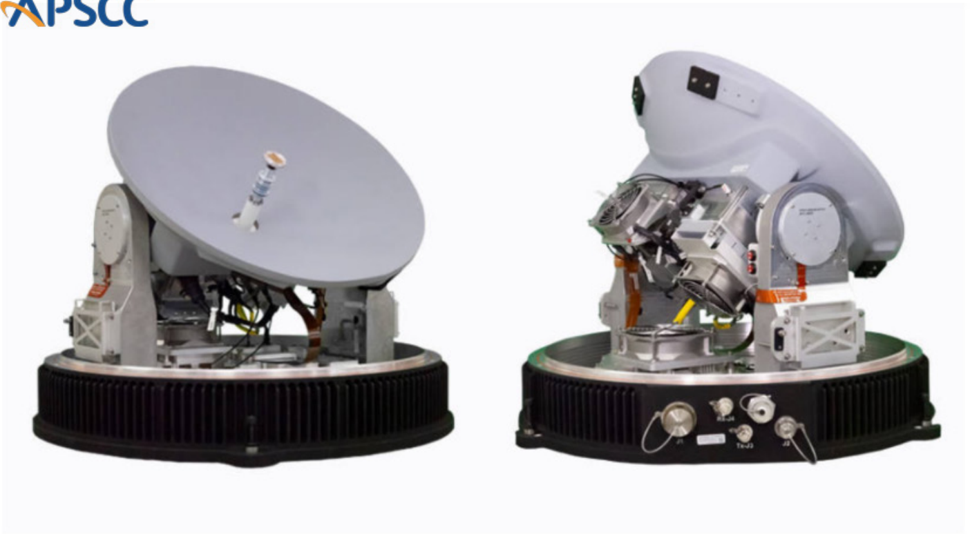
SATCOM-on-the-Move terminal built for military applications.

Additionally, the terminal will need to be able to switch from one satellite to the next simultaneously to avoid dropping the network connection. This requires either a phased array antenna capable of communicating in two directions simultaneously, or two antennas side-by-side. Otherwise, the terminal will have a multi-second network drop every time it has to leave one satellite and acquire another every 20 minutes or so.