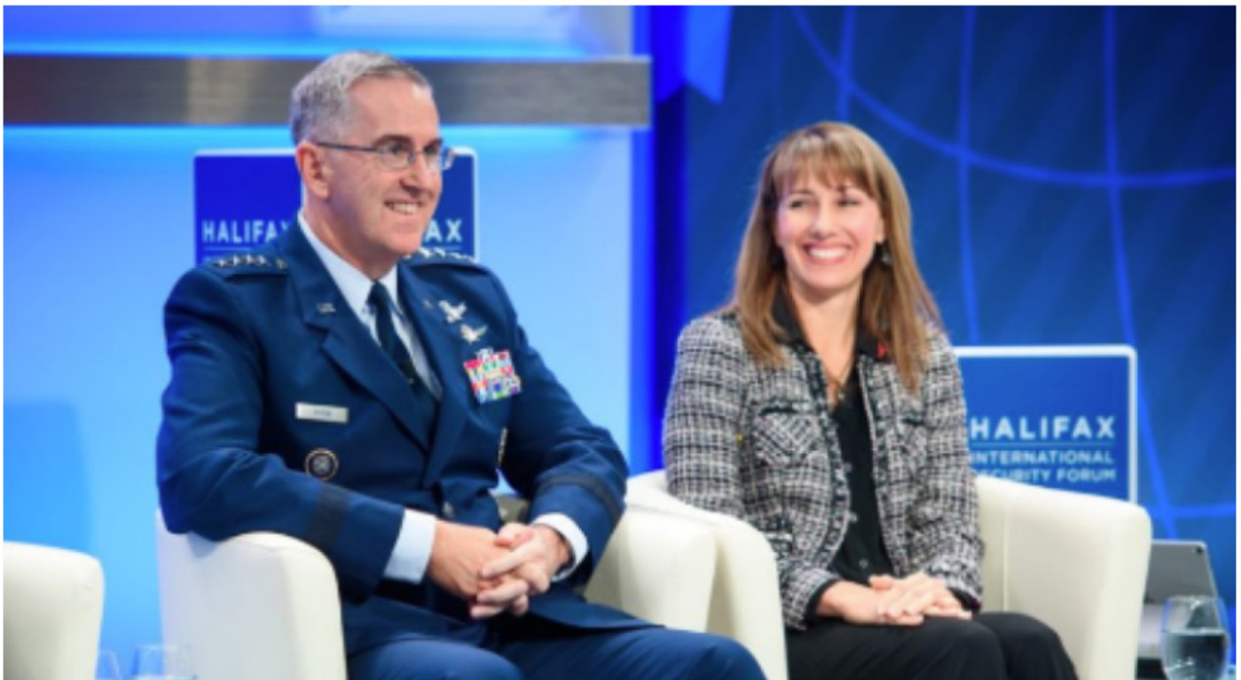
GEN John Hyten, Vice Chairman of the US Joint Chiefs of Staff, speaks at the 2017 Halifax International Security Forum.

General John Hyten, former head of US Strategic Command and now Vice Chairman of the Joint Chiefs of Staff of the US Department of Defense, is famously quoted as saying that he “won’t support the development any further of large, big, fat, juicy targets”, referring to the large GEO satellites that take years (and vast sums of money) to develop, launch and deploy, be they military or commercial in nature.