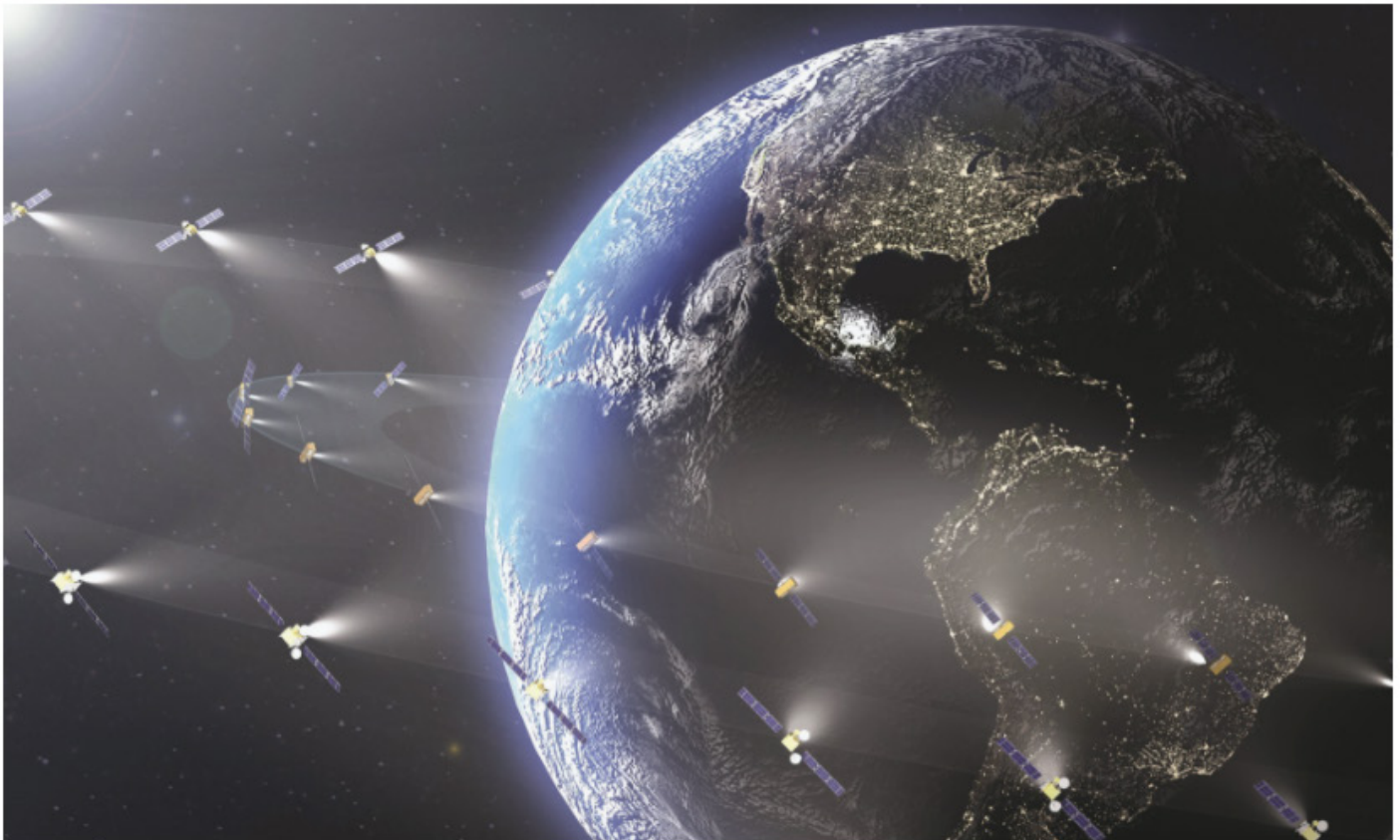
Multiple satellite constellations in varying orbits.

Ultimately the 2020s will be the decade we saw a global shift from GEO to NGSO constellations being the primary link for tactical users at the edge of their military networks. GEO satellites, especially new HTS and VHTS satellites, will absolutely continue to play a critical role in military communications, primarily for backhaul between theater command posts and headquarters as well as broadcast of high-bandwidth data to multiple domains. But the technical and price advantages of NGSO will ultimately carry the day for tactical edge users.