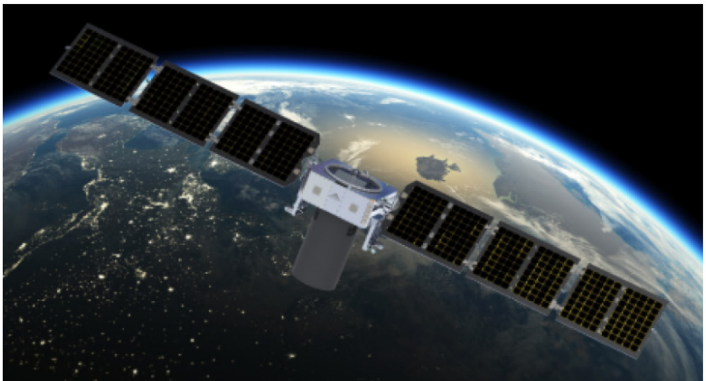
Blue Canyon Technologies is using the 150-kilogram X-SAT bus for DARPA's Blackjack program.

And these are just the commercially available networks. At some point it stands to reason that governments will begin to launch NGSO constellations of their own. Indeed, the US has been working to launch a NGSO constellation to test the merits of use in a battlefield environment. The DARPA project called “Blackjack” has already awarded Blue Canyon Technologies a contract to develop and launch 20 satellites to test various technologies ahead of the military-grade mega-constellation being developed by the newly formed Space Development Agency. The US Army has also said that they want to be actively operating on MEO constellations in the 2025-2027 timeframe.